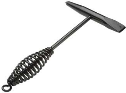
Taurus Chipping Hammer