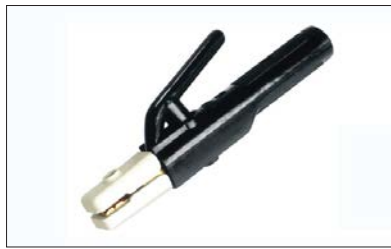
Taurus Electrode Holder German