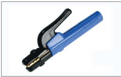
Taurus Electrode Holder Sampson