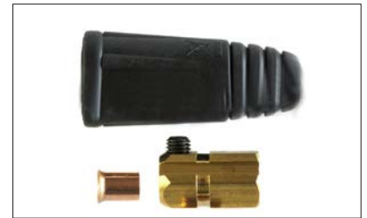
Cable Connector Female Socket