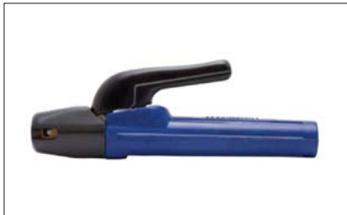
Taurus Electrode Holder Optimus