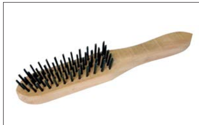
5 Row Wire Brush