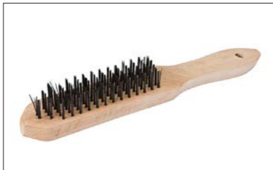
6 Row Wire Brush