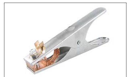
Taurus HD Earth Clamp Croc Type -400A