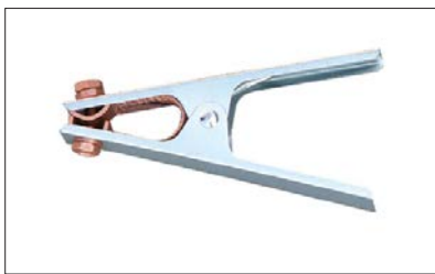
Taurus Earth Clamp Croc Type -200A