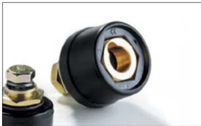
Cable Connector Machine Socket