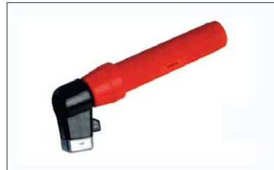
Taurus Electrode Holder Twistlock