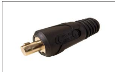
Cable Connector Male Plug