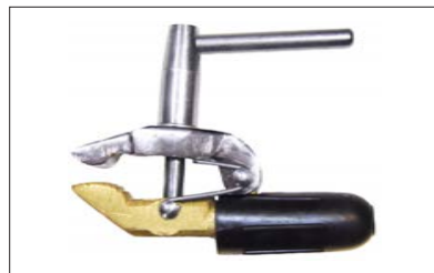
Taurus Earth Clamp Screw Type -600A