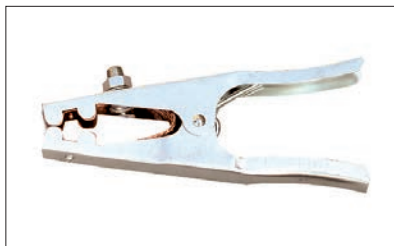
Taurus Earth Clamp Croc Type -500A